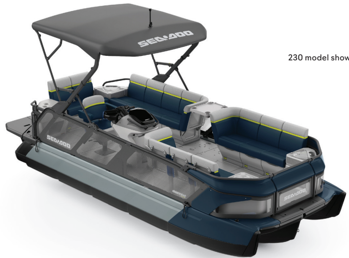
230 model shown