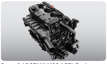
Powerful ROTAX® 1630 ACE™ Engine

A high-quality-finish powder-coated trailer is included in the price. Galvanized trailer finish optional.