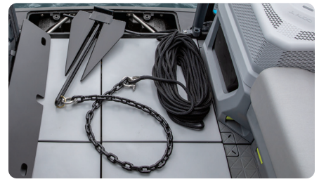
Dedicated Anchor Storage

With no outboard motor, usable deck space is maximized.