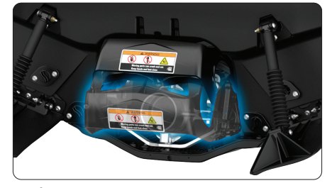
iBR° – The First Braking and Reverse System on a Pontoon

Proven to be reliable, this jet propulsion system offers an outsized fun-factor with a level of maneuverability never seen on a pontoon boat.