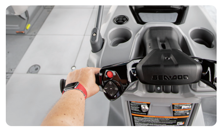
Unique Driving Experience

Fun, simple and stress-free handling. Easy to steer and easy to dock with intuitive Sea-Doo handlebar controls.<sup>1</sup>