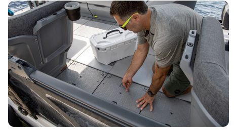
Switch Modular Deck

Fun, simple and stress-free handling. Easy to steer and easy to dock with intuitive Sea-Doo handlebar controls.<sup>1</sup>