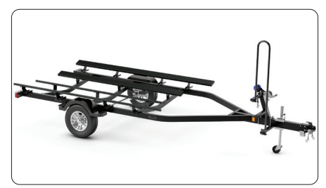
Switch Painted Trailer Included

Allows for nimble and precise handling, exciting performance and improved stability.