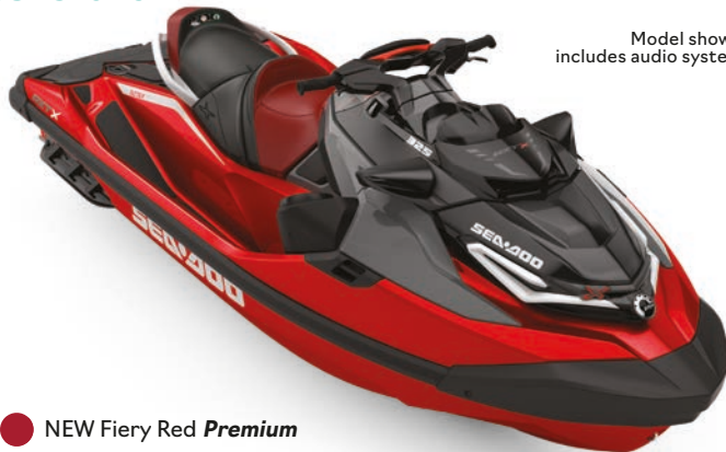
Model shown includes audio system