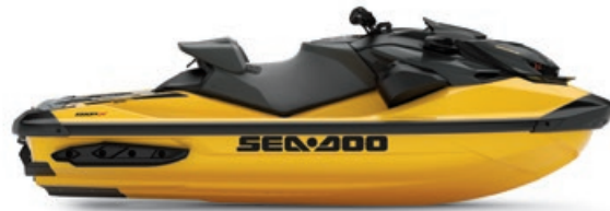
● Millennium Yellow