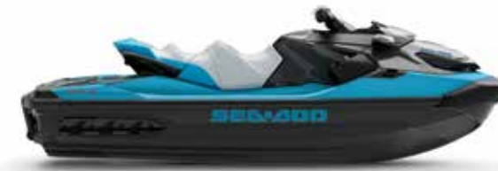
Beach Blue Metallic & Lava Gray (GTX 170 only)