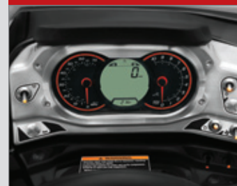
Premium helm with Cruise control and ECO™ mode