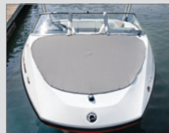
Canvas: Bimini, bow and cockpit covers