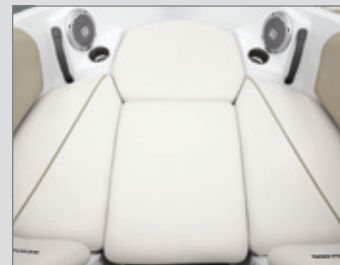
Bow filler cushion