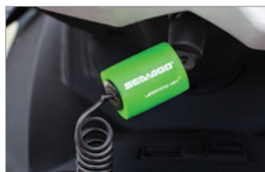
iControl™ programmable Learning Key™