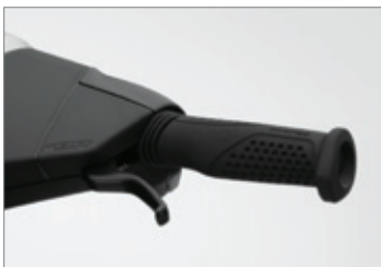
iBR (Intelligent Brake & Reverse)