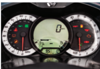
Digital information center