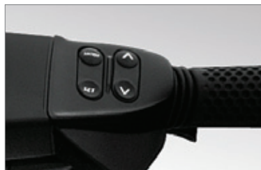
iTC including Touring / Sport mode