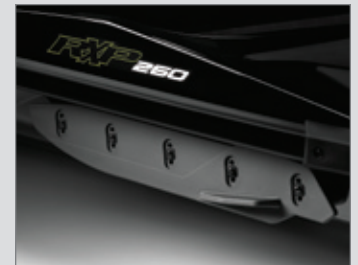
ALL-NEW Adjustable rear sponsons