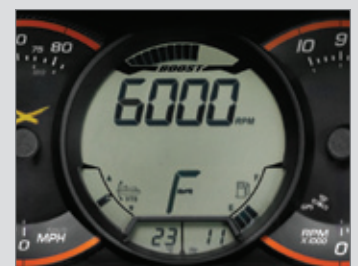
ALL-NEW X-Gauge with boost indicator

Introducing the best handling, performance-oriented watercraft on the market. With its Rotax ® 4-TEC ® race-proven, muscle engine and the revolutionary new T 3 Hull ™ for more traction on the water, it gives the rider all the advantages. The new Ergolock ™ system, includes a narrow racing seat, adjustable handlebars and angled footwells that have been tweaked to minimize upper body fatigue and provide more leverage. Add on the adjustable sponsons and trim tabs, and you'll have all the advantages to leave everyone behind on a buoy course.