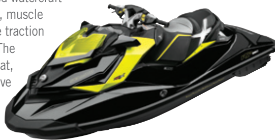
NEW MODEL FOR 2012

Introducing the best handling, performance-oriented watercraft on the market. With its Rotax ® 4-TEC ® race-proven, muscle engine and the revolutionary new T 3 Hull ™ for more traction on the water, it gives the rider all the advantages. The new Ergolock ™ system, includes a narrow racing seat, adjustable handlebars and angled footwells that have been tweaked to minimize upper body fatigue and provide more leverage. Add on the adjustable sponsons and trim tabs, and you'll have all the advantages to leave everyone behind on a buoy course.