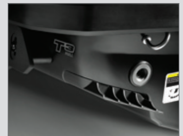
ALL-NEW Trim tabs