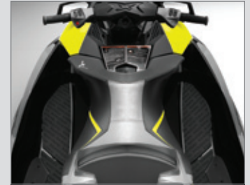
ALL-NEW Ergolock system