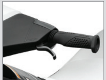
iBR™ (Intelligent Brake & Reverse)