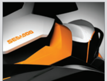
Aggressive X-inspired coloration