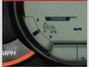
Driving Center including High-performance VTS™