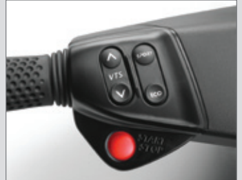
ECO™ and Sport mode controls